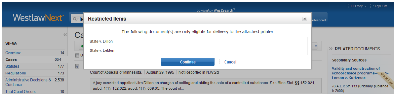
*Language subject to change

5. What will a user see when the email and download limit for the session is reached?